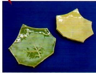
Please refer to the reverse side for more examples